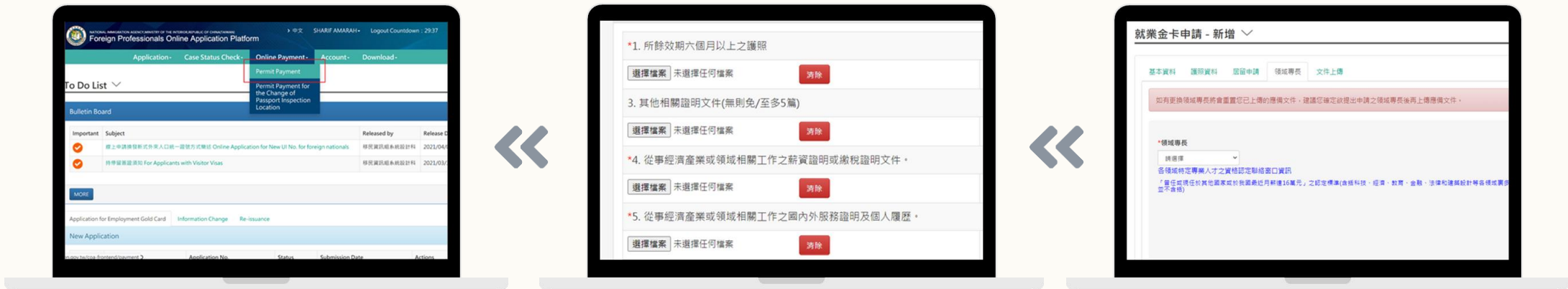
PAYMENT & WAIT FOR CONFIRMATION